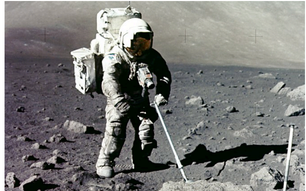
Apollo 17 astronaut Harrison Schmitt collects small lunar samples with a rake device. Apollo 17 stayed on the moon three days and returned 257 pounds of lunar rock.